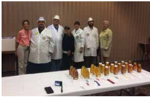
Show judges and stewards

The Heart of Georgia Beekeepers sponsored the Perry National Fair Honey Show on October 14, 2016. There were 14 exhibitors with 33 entries to the show. This show featured light, medium, dark extracted honey, and black jar.